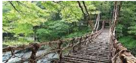
Vine Bridge of Iya Valley