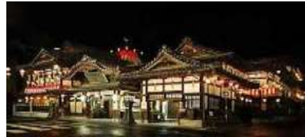
Dogo Onsen (Hot Spring Bath)