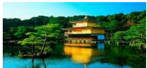
Kyoto, Golden Temple