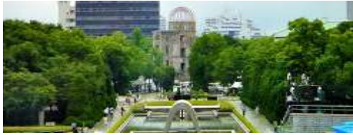
Hiroshima Peace Park