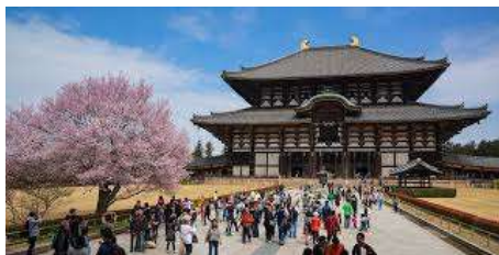
Nara, Todaiji Temple