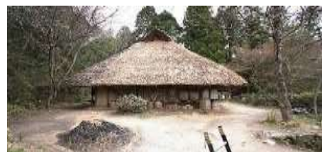
Shiga, Ninja Village